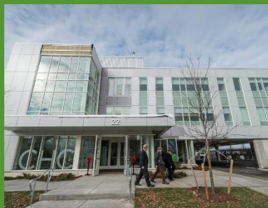
Stamford Fifth Street