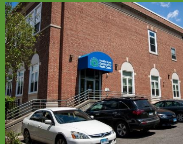
Stamford Franklin Street